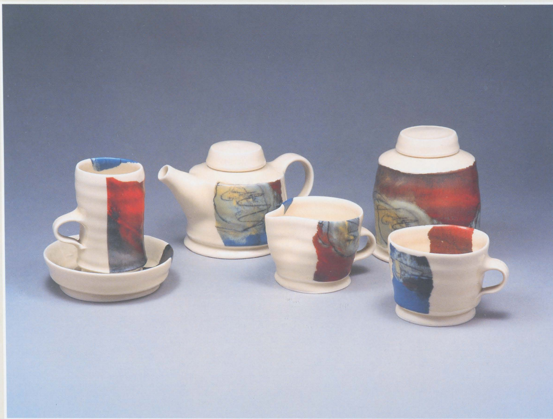
Ashley Howard, porcelain tea set with enamel collage