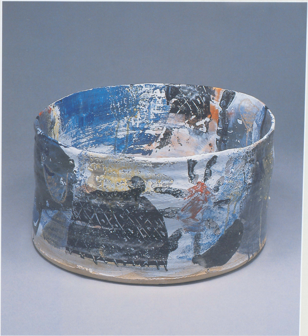
Ashley Howard, stoneware with brush and collage enamel 40cm diameter by 30cm high