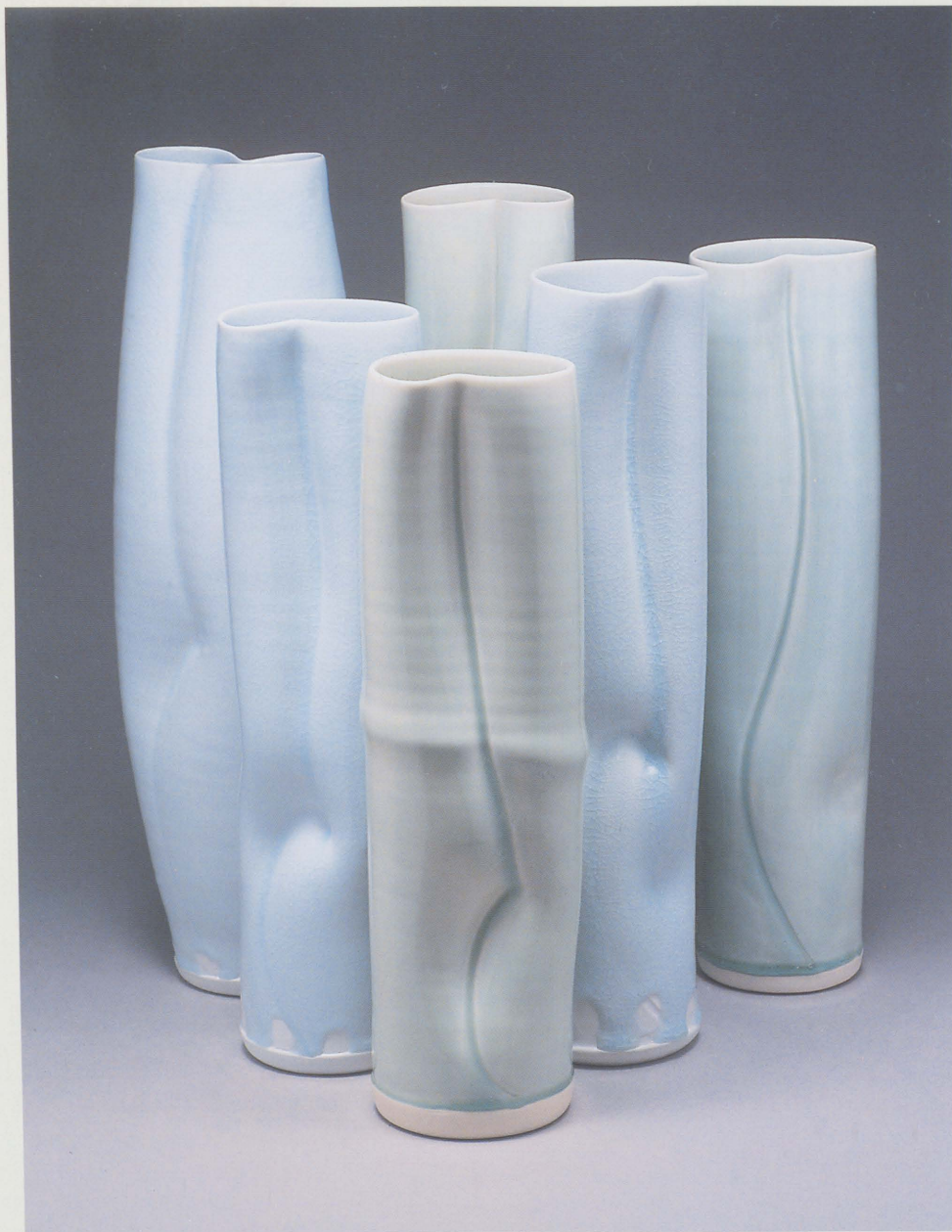
Martin Lungley, celadon and copper glazed porcelain vases tallest 40cm