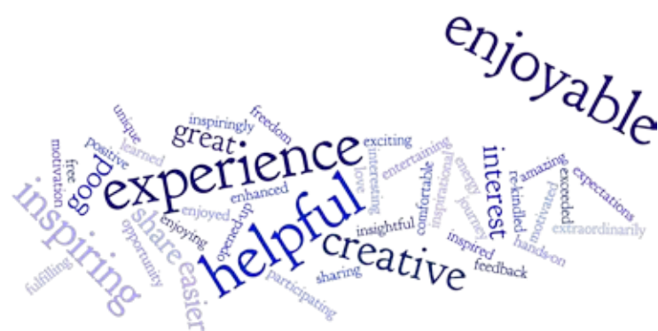
Figure 3 Wordle of student participant responses to the question: Please tell us about your experience of the Creative Writing group

Towards the end of the project (June 2012), we emailed students asking them to sum up their experiences of participating in Create Curate Collaborate! Results indicated that creative writing in the extracurricular groups had tangible benefits for students' assessed work. Many of the students attested to the benefit of the group for their academic writing and their studio work. The three examples below are representative of their replies: