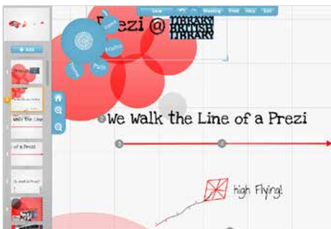
Figure 2 Screenshot from the students' Prezi, shown in edit mode

Another higher education student attendee of the creative writing group at UCA found the tool useful to begin her dissertation planning. She commented that: