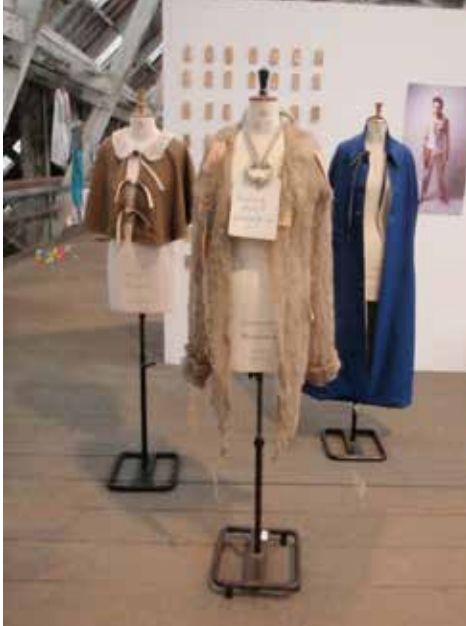
Figure 4 'The Cloak of Dreams' consists of three pieces: a reversible cape made of tweed and canvas (with a removable knitted string collar and leather button), a cardigan knitted out of hemp and enhanced with labels (with people's dreams written on them) and a reversible cloak made out of wool and canvas (with reversible and removable collar) © A Giraud-Telme 2012

An example of studio work inspired by the project is The Cloak of Dreams (see figure 4), its creator explained that: