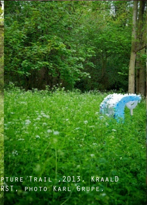
IMAGE: THE UNDERWATER SCULPTURE TRAIL, 2013, KRAALD REUSED INSTALLATION THIRST.