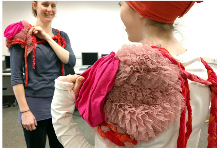
Figure 2. Image from a rehearsal in Sheffield, UK of the dancers interacting with the textile touch sensors embedded in the pink pleated fabric.

The wearable computing system consists of a collection of capacitive touch sensors worn on one shoulder of each dancer and a motor with a ribbon attached placed near the neck. The sensors and actuator on each dancer are controlled by a wifi-enabled microcontroller 1 . Each of the capacitive touch sensor electrodes are a single conductive thread sewn to the underside of a fabric pleat as seen in Figure 2. The electrodes are connected to a capacitive sensing chip 2 which handles the calibration and measurement of the signals.