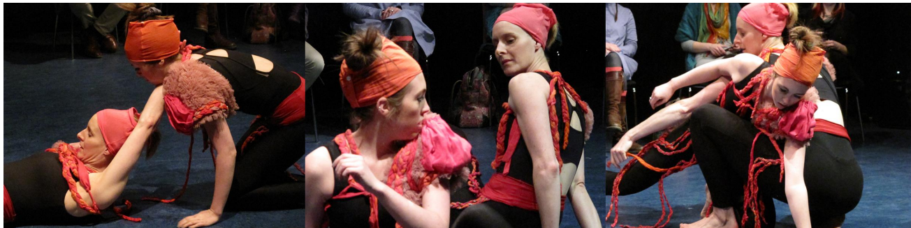
Figure 1. Images from performance of the piece in February 2016 in London, UK

The sensors and actuators were built into garments worn on one shoulder of each dancer and incorporated into a complete costume worn during performance. The network connecting the sensors and actuators utilised the infrastructure tools, emerging as the preferred protocol for 'Internet of Things' applications, while the visual design of the garments actively distanced itself from a technological aesthetic.