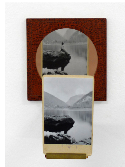
Snapscope #1, 2012

JW: You enjoy the interaction of doubling and have talked in the past of this being "narcissistic". There do seem to be references to René Magritte in your Crystal Girls series.