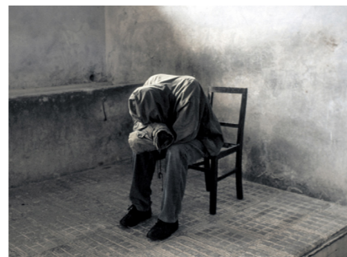
UNREST (Lisboa), 2000

NS: I was interested in working with the early Pin Up aesthetics: photographs taken by amateur photographers with no artistic background: where the composition is raw, when images are not made to be shown, but to be seen. In the style of Irving Klaw and his sister Paula's photographs.