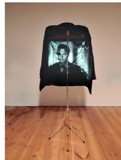
Dead Weight, 2007

I was also interested in the print formats of these photos. They were pocket sized due to fact that they would be sent through the post as clients were too ashamed to be seen acquiring them.