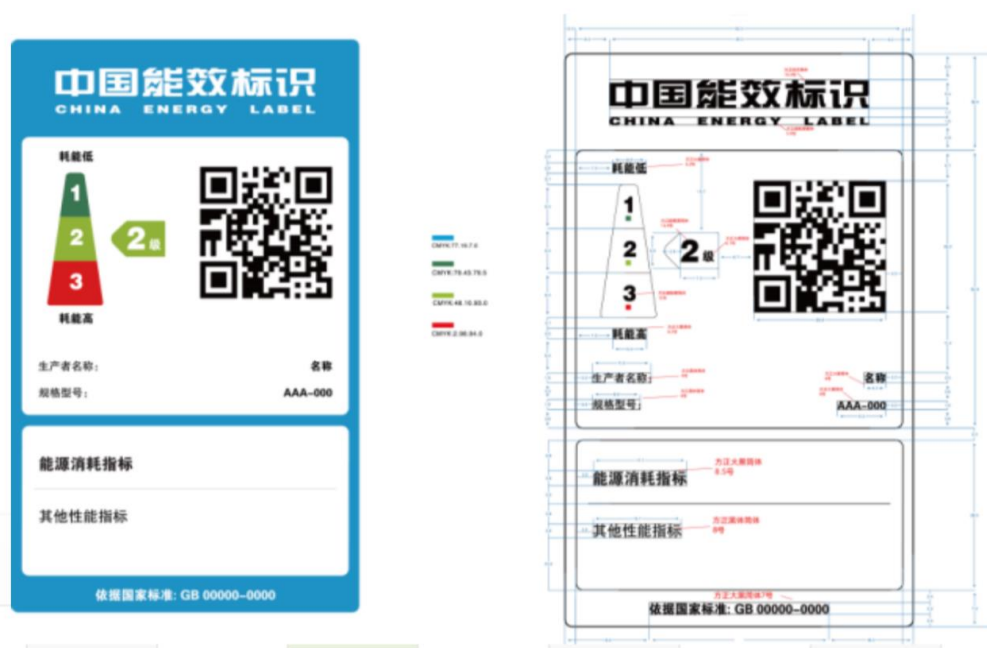
Chart 2. Sample of CEL without Top Runner Logo

In August 2015, ten years after the implementation of MAEEL, NDRC and SAMR issued a revised version of MAEEL to promote higher efficiency and energy-saving products, in accordance with the Law of Energy Conservation and the Action Plan for Energy Conservation and Emission Reduction and Low Carbon Development (2014- 2015). On 1 st October 2016, a new CEL with a QR code format was launched 29 .